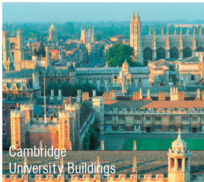
Cambridge University Buildings

EC Cambridge was established in 1983 and is the most centrally located language school in the city. It is situated right in the heart of town, less than 100 metres from the Market Square and the central city library, to which all EC students have free access. The famous King's College Chapel and the main bus station are both only 3 minutes' walk away. You will find the school in a charming period building dating back to 1820.